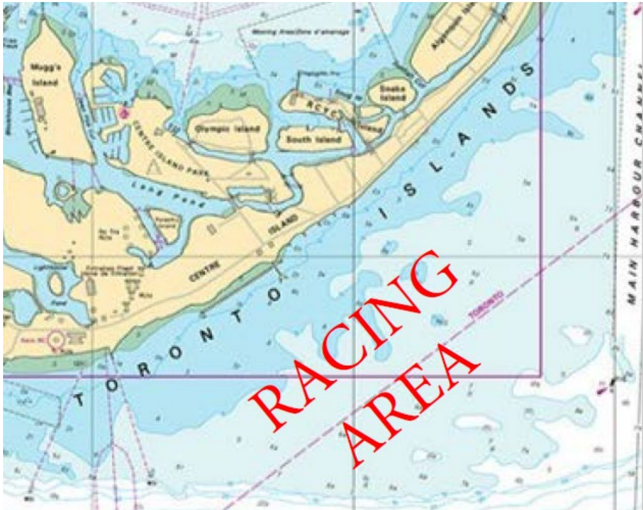
Figure 1: Racing Area

7.1. Racing area will be on Lake Ontario, South of the Toronto Islands.